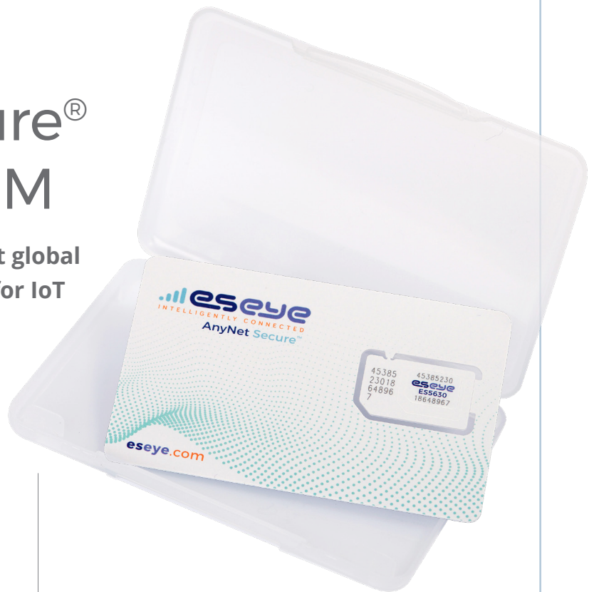
2FF/3FF/4FF SIM Cards

Based on our unique AnyNet Secure ® SIM technology, with configured multi-IMSI capability, we aim to deliver near 100% connectivity out-of-the-box. Our solution enables you to manufacture and deploy a single product SKU worldwide, massively reducing potential complexity in IoT developments and associated deployment costs.