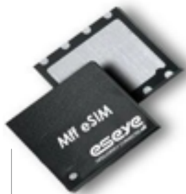
MFF2 Embedded SIM

A secure, scalable and resilient global cellular connectivity solution for IoT and M2M devices.